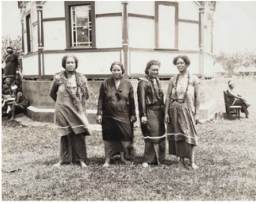
Image by Alfred James Tattersall, 'THE LEADERS OF THE WOMEN'S MAU' REFERENCE PA1-O-795-05, ALEXANDER TURNBULL LIBRARY, WELLINGTON, NEW ZEALAND